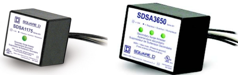
Secondary Surge Arrestors

Other Custom Control Panels Available Features: