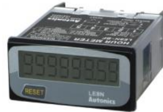
Elapsed Time Meter